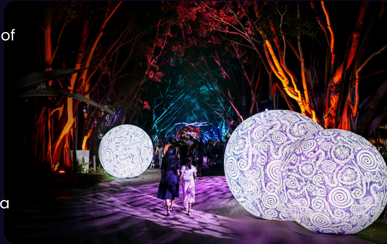
Image of Lightscape